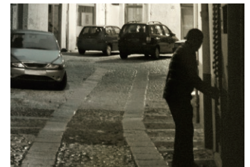
AG Neovo RX-32E