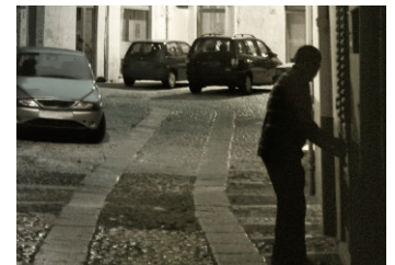
AG Neovo RX-42E